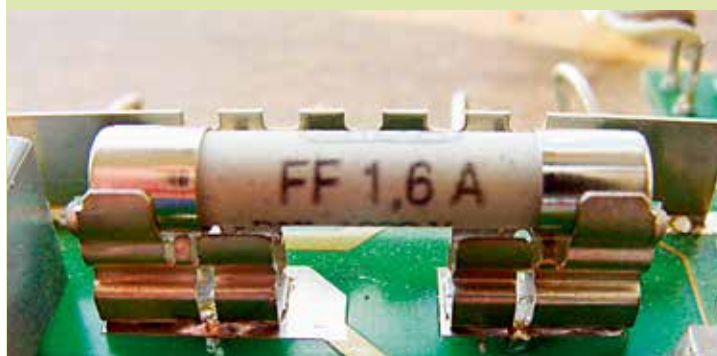
Figure 1b Fuse-holder mounted on the circuit board