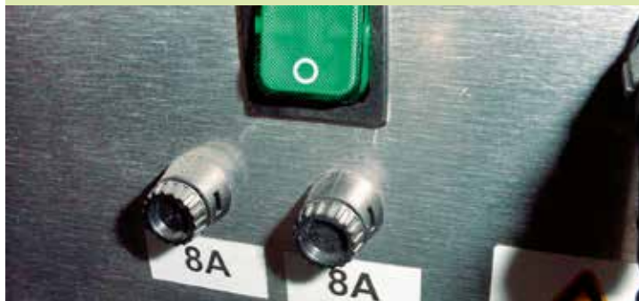
Figure 1a Fuse-holder mounted on the back panel

The subject is fuses, namely miniature fuses – or to be more specific, miniature fuse-holders of the kind that are designed to be used on the appliance back panel or on the circuit board (Figure 1). These holders are frequently selected on the basis of their dimensions alone: 5 x 20 millimetres – it matches – and the job is done! Users who base their choice on 'current rating' tend to be a bit more circumspect: the fuse is rated at 6.3 A, the holder at 10 A – it matches – and the job is done! In many cases such an arrangement works, but more often than not the equipment manufacturer cannot understand why the fuse has operated too early or why there is a worrying increase in temperature at the fuse-holder. There is, alas, much more to selecting an appropriate fuse-holder than just looking at its size and current rating ... what about power dissipation, for example?